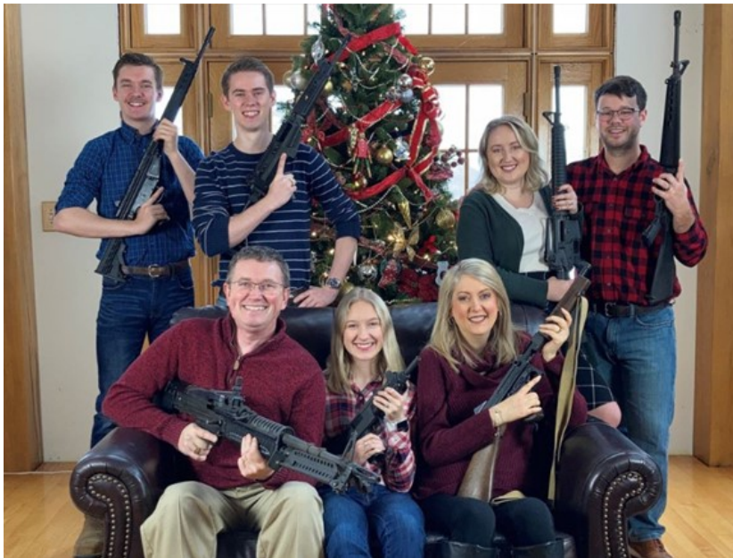
U.S. Rep. Thomas Massie (R-KY) in a Christmas photo of his family holding guns, in this image obtained from Twitter, posted on December 4, 2021.