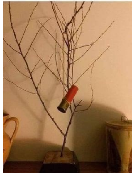
My favorite Christmas decoration. It's a cartridge in a bare tree.