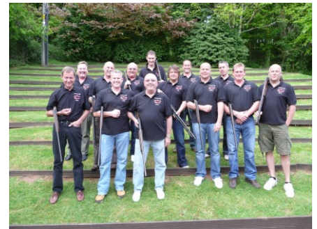
Ashcombe 2008 above and 2009 below